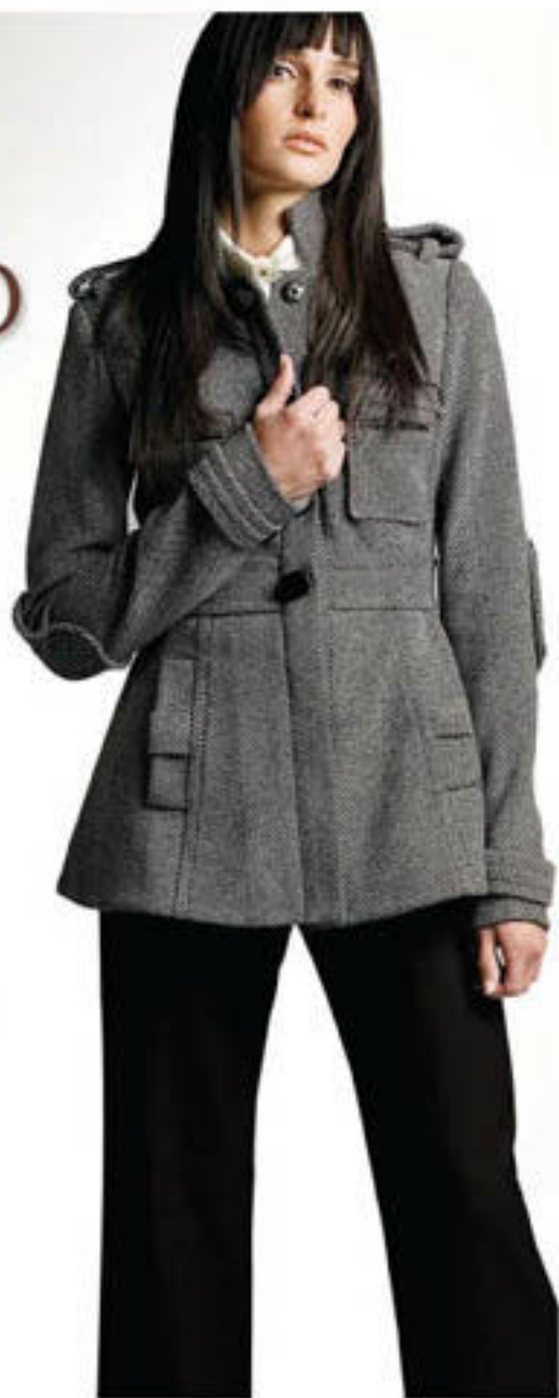
Above: Larvin dress, $3,150 and Valentino spectator shoes, $895, from Tender, Birmingham; earrings, $19 and bracelet, $29, from Flash Accessories, Birmingham. At right: Alexander Wang pants, $395, blouse, $375 and trench, $795, from Barneys New York Co-op, Troy

A more formal, head-to-toe approach to fashion re-emerges after a summer of carefree youthful flounce. The dress - still an essential piece - is now tailored with strong shoulders and a nipped waist. Add a bit of humor with colorful opaque tights. The menswear trend is also all about structure, with sleek, higher-waisted trousers and polished jackets. Mix in a ruffled secretary blouse to give a hint of softness to the look.